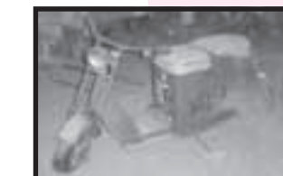
Late 40's Cushman Step Through Motor Scooter (Good Condition)

1973 Chevy Cheyenne Super 10 Pickup, 454 V-8, Auto Trans., Air, FM/AM, 6 Cyl. Engine, 3 Speed on Column w/High Low. This vehicle is in good condition but has not been driven in several years (original). Stored under a roof. Very little rust.