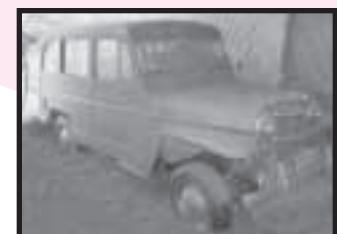
1952 Willys Motor, Mdl. 6226, 2x4 Station Wagon/Delivery Sedan

1973 Chevy Cheyenne Super 10 Pickup, 454 V-8, Auto Trans., Air, FM/AM, 6 Cyl. Engine, 3 Speed on Column w/High Low. This vehicle is in good condition but has not been driven in several years (original). Stored under a roof. Very little rust.