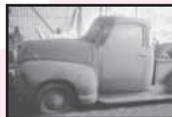
1950 Chevrolet 3100 Pickup, 6 Cyl. Engine, 4 Spd. Trans. Pickup is in very good condition. Has not been driven in several years, but has been stored under roof. Very little rust.