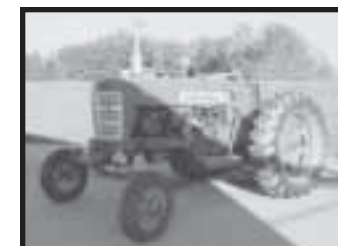
Farmall 450 Diesel Tractor, Wide Front End, 3 Point, 4,108 Hrs., S/N 20389