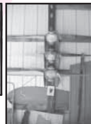
(2 Ea.) McCauley Mdl. 2036C14 Propellers

McCauley Mdl. 2034CT69 Prop (2 Ea.) Wood Prop Hubs