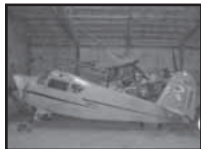
1940 Rearwin Cloudster Mdl. 8135 N-25531, S/N 818 971 Hrs. Total Time

Engine: Ken Royce Mdl. 7G (7 Cyl.) 971 Hrs. T.T. on Engine Senenich Wood Prop