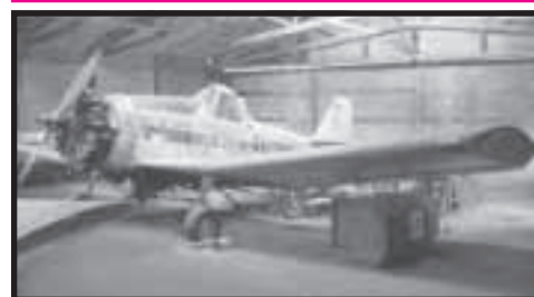
1976 Weatherly 201C Aircraft N-1298W, S/N 1006 1,006 Hrs. Total Time

Pratt & Whitney Engine: R-985-ANI 1,020 Hrs. S.M.O.H. By Aero Engines Hamilton Standard Prop: 2030-227 w/6101 A-12 Blades