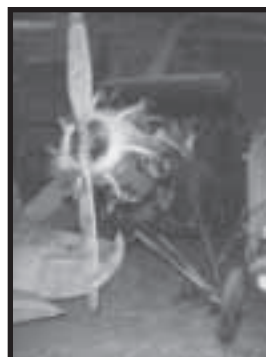
1930 Spartan Mdl. C3-225 Bi-Wing N-C718N, S/N A-12 2,134 Hrs. Total Time