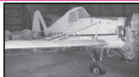
1965 Callair Mdl. A-9 N-8290H, S/N 1232 1,283 Hrs. Total Time

No engine. Aircraft is disassembled and has some damage.