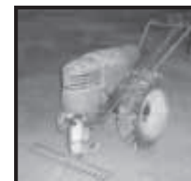
David Bradley Super Power Walk Behind Sickle Mower w/Continental Gas Engine, Attachments Include Plow and Disc

8' Grain Drill; Side Delivery Hay Rake on Steel; Flare Box Wagons; Flat Rack; Water Wagons; Snyder Poly Tanks