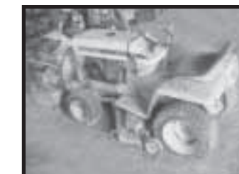
Cub Cadet 107 Riding Mower w/ Hydrostatic Drive, 10 H.P., 42" Deck 39" Snowblower for Cub Cadet