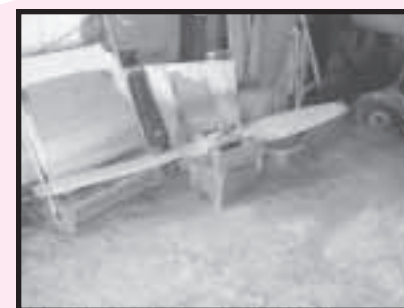
(2 Ea.) Hamilton Standard Ground Adjustable Props, (1) w/MA-96K-0 Blades

McCauley Mdl. 2034CT69 Prop (2 Ea.) Wood Prop Hubs