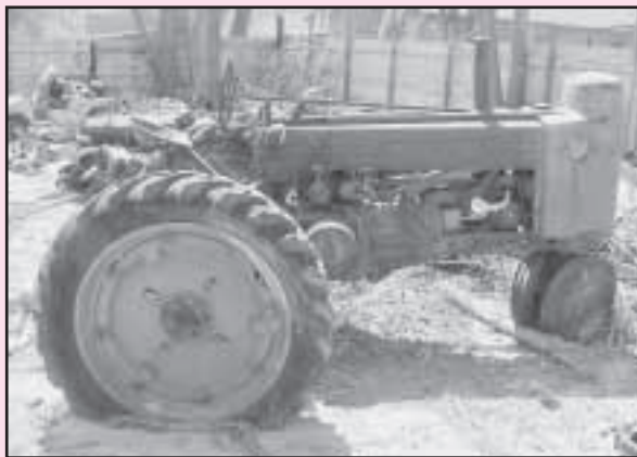
1943 J.D. A Styled Front w/Cornpicker Nose, Being Sold for Parts, Mostly Complete; McCormick Deering 1020 Tractor, Completely Disassembled Fairly Complete; Various 1020 Tractor Parts; J.D. & I.H. Steel Rear Tractor Wheels, Including J.D. 12 Spline, I.H. 1020 and F-20; J.D. and Misc. Steel Front Tractor Wheels; Several Wagon and Implement Steel Spoke Wheels; Wood Spoke Wheels