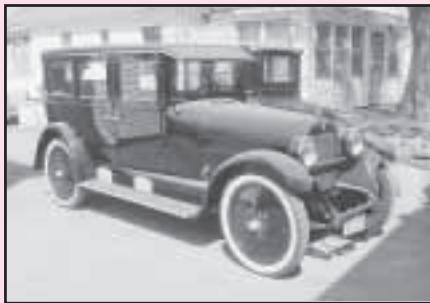
1924 Nash Mdl. 699 Sedan, Straight 6, 3 Speed, Restored, Immaculate Condition (One of Only Seven Still Remaining)