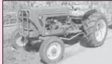
Cockshutt 540 Tractor, 3 Pt., 4 Cyl., Wide Front, Runs Good, (Has Loader, Loader Sells Separate), Built In Canada

GM-307 6 Cyl. Engine Complete; Chevy 235 Engine Rebuilt; Parts From 30's Thru 50's Era Including: 235 Engine Blocks; Grills; Hub Caps; Emblems; Exhaust Intake; Valve Covers; Crankshafts; Cams; Headlights; Coils; Approx. 60+ Starters; Generators; Alternators; Fuel Tanks; and Several Other Parts; Misc. New (Old) Stock