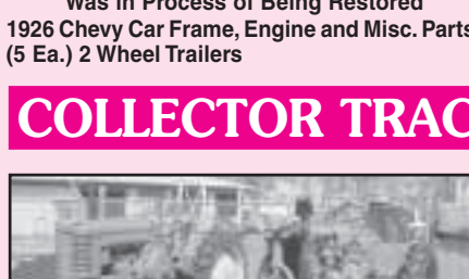
1943 John Deere A, Styled Front End, 3 Pt., Restored 1928 Farmall F-20, Needs Restored