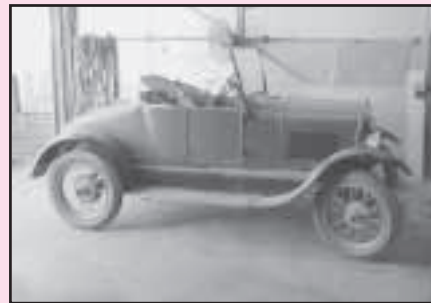
1926 Model T Roadster, Runs, Needs to be Restored