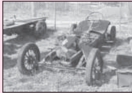
1915 Saxon Car w/Undercarriage, Engine, Drive Train and Some Body Parts Model T - Form A Truck Undercarriage and Rear End