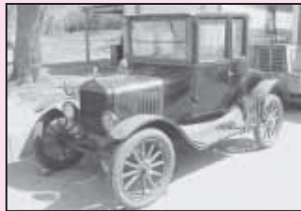
1924 Model T Coupe, Runs, Complete, Some Restoration Already Done