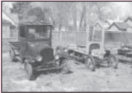
1920 Model T Truck w/Engine, Drive Train, Cab, Hood, Fenders, Partially Restored 1917 Model T Truck w/Engine, Drive Train, Partial Cab (2 Ea.) Model T Undercarriages w/Wheels and Drive Train