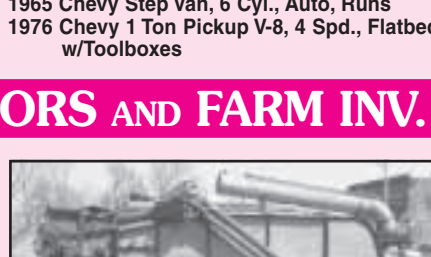
1906 Case Threshing Machine, Needs Restored