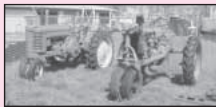
1943 John Deere A, Styled Front End, 3 Pt., Restored 1928 Farmall F-20, Needs Restored