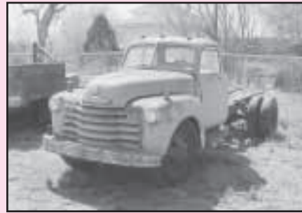
1948 Chevy Loadmaster 2 Ton Cab and Chassis, Runs Good, Needs Restored 1949 Ford F-4 Dump Truck, Bad Engine, Needs Restored