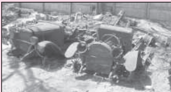
1927 Chevy Car Undercarriage w/Engine Radiator and Misc. Body Parts 1916 Reo Truck Undercarriage w/Engine, Drive Train and Misc. Body Parts