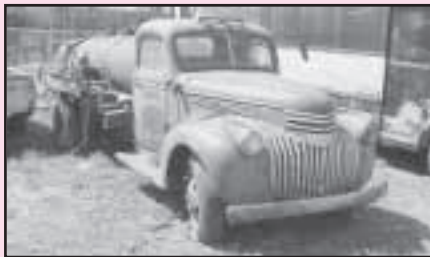
1946 Chevy 1 1/2 Ton Fuel Truck, Bad Engine, Needs Total Restoration